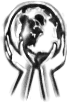
Mission Festival Sunday