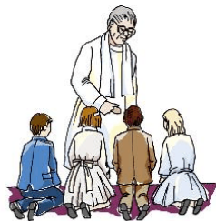
First Communion Class